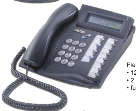
FlexSet 120D • 12 buttons • 2 x 24 LCD • full speakerphone