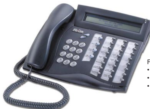
FlexSet 280D • 28 buttons • 2 x 40 LCD • full speakerphone