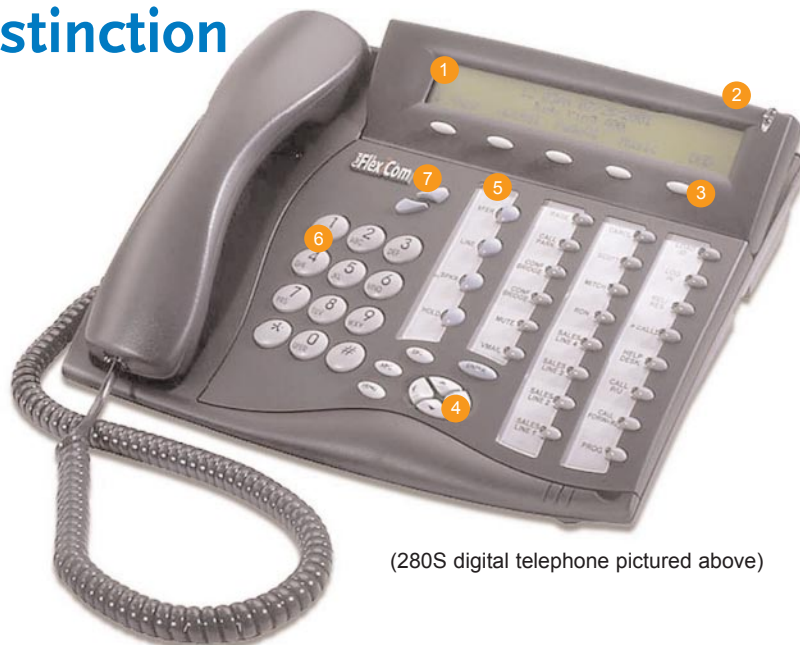
(280S digital telephone pictured above)

Available in your choice of pearl white or charcoal grey, all Coral FlexSets come with four buttons configured system-wide for consistent operation. A system administrator or individual users can define remaining buttons as needed.