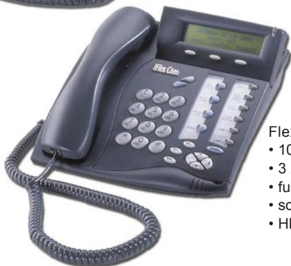
FlexSet 120S • 10 buttons • 3 x 24 LCD • full speakerphone • soft-key operation • HDF support