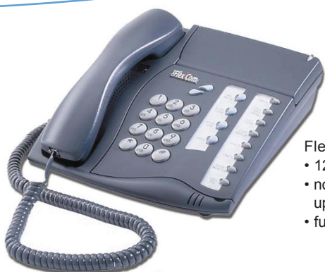
FlexSet 120 • 12 buttons • no display (120 upgrades to 120D) • full speakerphone

and ensures you will be ready for the communications demands of tomorrow.